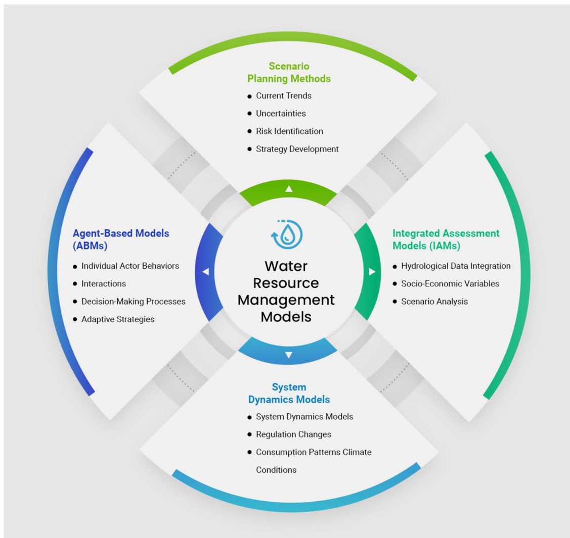
FIGURE 1 Socio-hydrological models for water resources management. Source: Authors.

timely responses to extreme weather events, droughts, and floods, enhancing resilience (Cosens et al., 2021).