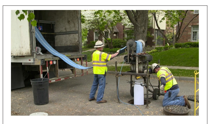
FIGURE 4 | Equipment used during the installation of CIPP. https://www.aegion.com/capabilities/cured-in-place-pipe/insituform-cipp.

Trenchless CIPP (Figure 4) process involves a liquid thermoset resin-saturated material that is inserted into the existing pipeline by hydrostatic or air inversion, or by