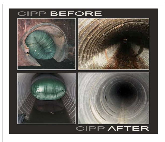
FIGURE 5 | CIPP before, during, and after installation. https://www.prweb.com/releases/uspipeliningpressrelease/june2016/prweb13466103.htm.