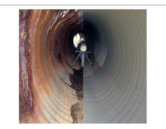
FIGURE 2 | Machine pipe renewal for SAPL. https://www.estormwater.com/ pipe-distribution/pipeline-rehabilitation-products.

Trenchless renewal methods avoid disrupting large sections of neighborhoods and cities and prevent lengthy construction times. In doing so traffic accumulation and social costs are kept to a minimum (Argyrou et al., 2018). This is because only a small portion of the pipe is needing to be accessed in order to repair/renew unlike open cut pipe renewal methods. Trenchless pipe lining renewal methods remove much of the headache associated with restoring the much-needed restoration of underground piping systems across North America ( Figure 3 ).