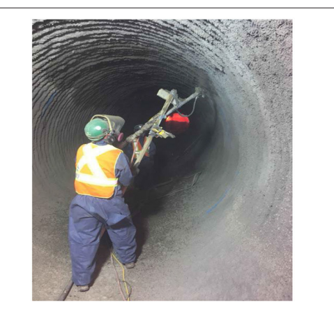
FIGURE 3 | SAPL method used for large conduits. https://www.vectorconstruction.com/geospray-pipe-and-culvert-lining.