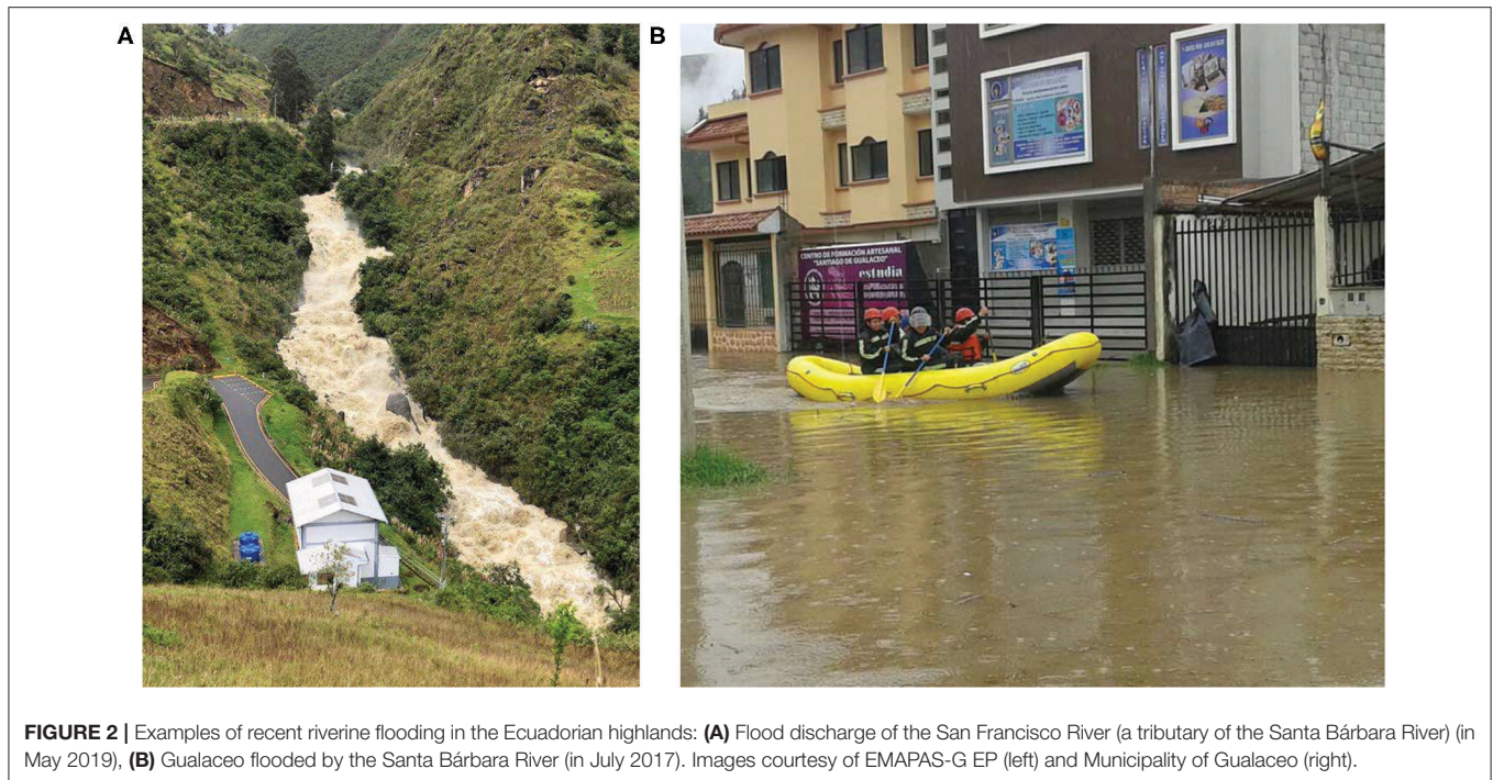
FIGURE 2 | Examples of recent riverine flooding in the Ecuadorian highlands: (A) Flood discharge of the San Francisco River (a tributary of the Santa Bárbara River) (in May 2019), (B) Gualaceo flooded by the Santa Bárbara River (in July 2017).