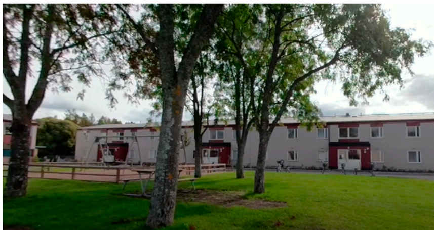
FIGURE 3 Screenshot from a 360 video clip of Ulvsättersvägen, facing south-south-east. The communal greenspace is mainly laid to grass, also hosting a tree grove and a playground with swings. The two-storey blocks of flats are seen in the background, separated from the greenspace by a paved surface.

and themes. Thematic saturation, when new information produced little or no change to the codebook (Guest et al., 2006), was reached when approximately 75% of the meaning units had been coded into sub-themes. The sub-themes were grouped into five themes designed to capture and describe common patterns and topics in the responses. A calculation of the distribution of meaning units across the themes was performed. The themes, sub-themes, and extracted meaning units were developed in dialogue between the authors and two additional senior researchers.