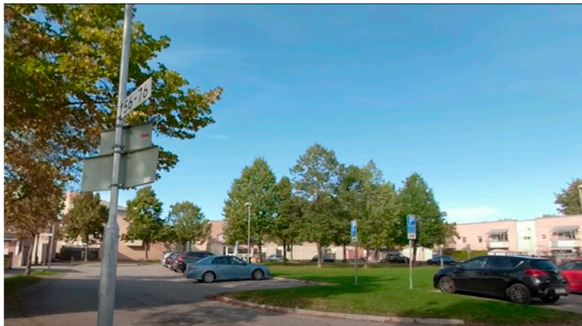
FIGURE 2 Screenshot from a 360 video clip of Hemsta, facing west. The communal greenspace is laid to grass and surrounded by car parks. The two-storey blocks of flats are in the background.