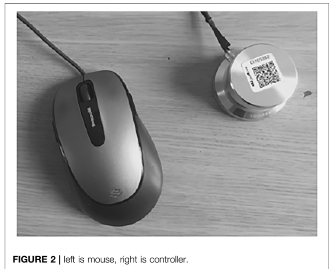
FIGURE 2 | left is mouse, right is controller.

The documents were organized by country of origin of the document. There was a main timeline with documents originating from Switzerland. From this timeline, it was