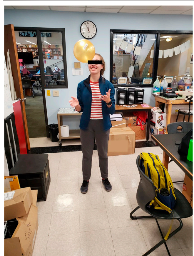
FIGURE 3 | Experimental setup: a participant attempting to catch a ball during a "one-on-one" dodgeball game at the school library.

(Table 2). Common physical activities reported included: dance, soccer, gymnastics, running, tae-kwan-do, swimming, volleyball, and tennis. Nine participants did not regularly perform any type