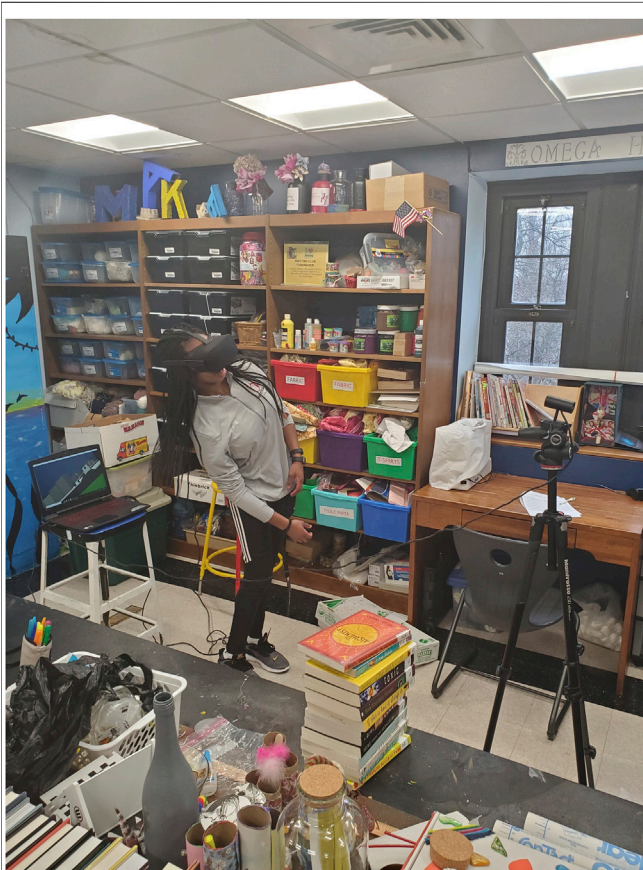
FIGURE 2 | Experimental setup: a participant wearing the Oculus Rift headset and avoiding a ball within the virtual park scene at the school library.