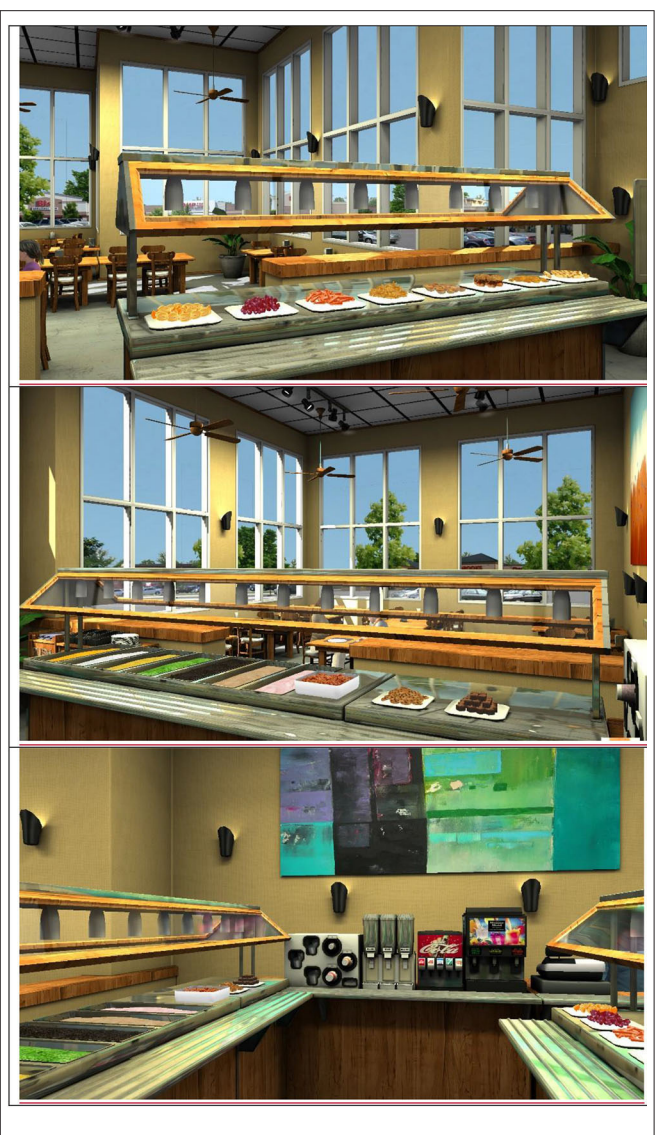
FIGURE 1 | Images of the VR Buffet from the user's perspective.

Participants were screened online or by telephone. For eligible participants, an index child was identified who met study criteria (see Participants). Participants consented to participate online and continued to the online pre-test questionnaire, which included baseline measures of attitudes, beliefs, and demographic characteristics. Participants were contacted by phone to schedule