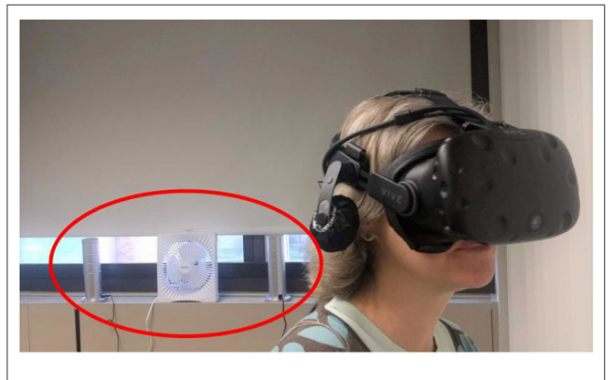
FIGURE 3 | Photo of physical lab room and user; scent administration equipment circled in red.