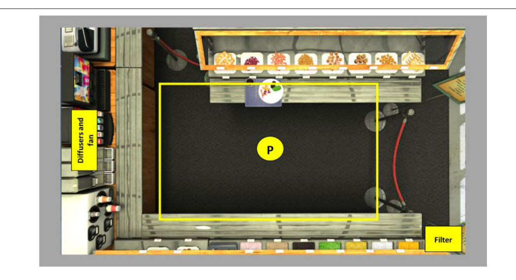
FIGURE 2 | Overhead view of VR Buffet environment with approximate location of olfactory equipment. Circle labeled "P" is starting point of participant; open yellow box represents tracking area within the physical room.