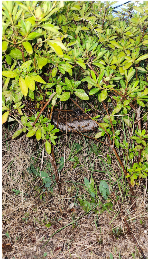
FIGURE 1 The nest of paper wasps ( Polistes rothneyi ).

Initial therapeutics consisted of 10 ml/kg Ringer's lactate IV based on 70 mL/kg/day maintenance in addition to 5% dehydration aimed to be replaced over 8 h. Additionally, low dose epinephrine 0.01 mg/kg IV, dexamethasone 0.2 mg/kg IV, chlorpheniramine 0.2 mg/kg SC, maropitant 1 mg/kg SC, esomeprazole 1 mg/kg IV, ampicillin/sulbactam 12.5 mg/kg IV was added to the therapeutic plan. The dog was monitored in the intensive care unit after the placement of a urinary catheter. However, the dog remained anuric, with no urine output observed even after 8 h.