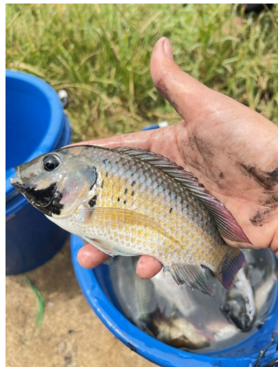
FIGURE 1 Sarotherodon melanotheron from our study area, easily recognized by the distinctive black area on its chin, is readily identified by local fishermen.

The collecting of blackchin tilapia (Figure 1) was performed from July to August 2024. A total of six points were surveyed in Chumphon Province, covering four different environments: sea, estuary, canal and shrimp farm (Figure 2). The specific locations and details are as