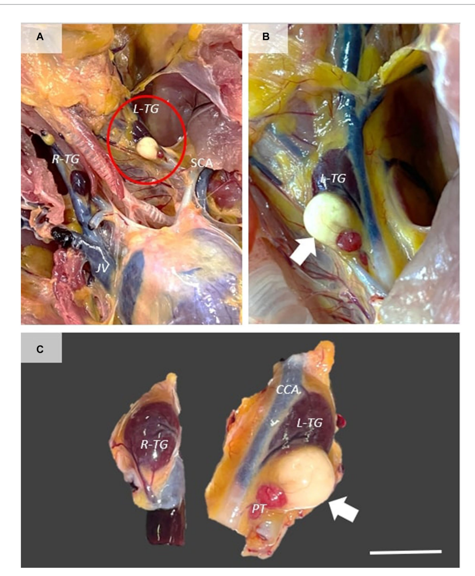
FIGURE 1 Gross features of thyroglossal duct cyst. (A) Ventral view of the cervical and cranial extremity of the thoracoabdominal cavity, showing the presence of a large mass directly attached to the left thyroid gland (white arrow). (B,C) The mass is well demarcated, showing moderate compression of the adjacent thyroid gland. Scale bar = 0.5 cm. R-TG, right thyroid gland; L-TG, left thyroid gland; SCA, subclavicular artery; CCA, common carotid artery; PT, parathyroid gland.

the most common sites are infrahyoid (70.2%), suprahyoid (25.5%), and intralingual (4.3%) (15).