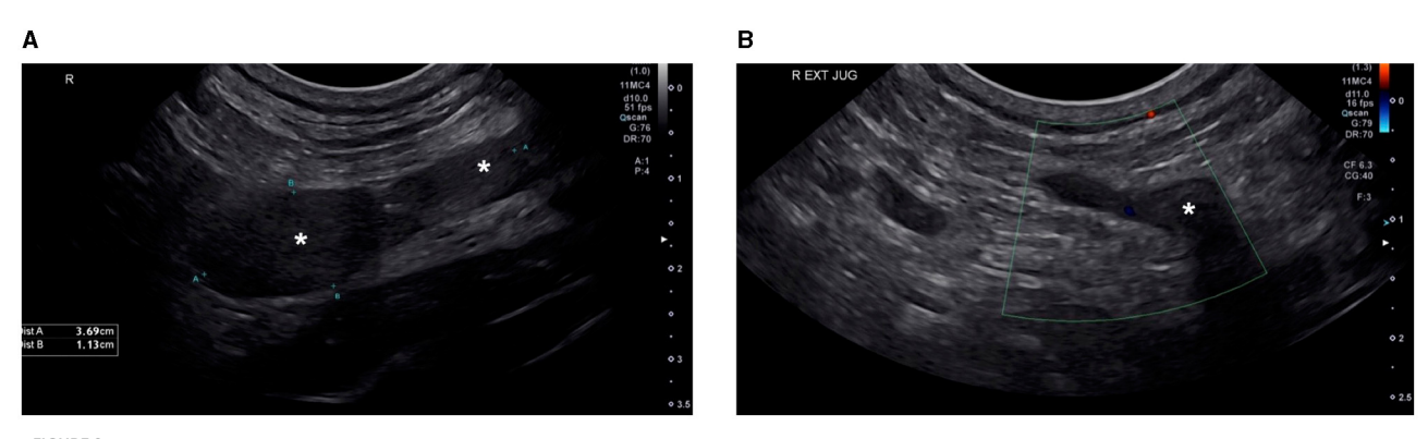
FIGURE 2 Cervical ultrasound ultasound images. Ultrasound image (A) shows an extensive echogenic thrombus (labeled *) filling the majority of the lumen of the right external jugular vein. Ultrasound image (B) shows the absence of Color Doppler flow signal in the right external jugular vein at the level of the thrombus, confirming obstruction of the vessel by the intraluminal thrombus.

pink opaque effusion. Subsequent thoracocentesis was performed using an additional 14G \times 5.25 inch BD Angiocath<sup>TM</sup> catheter (BD, Edison, NJ) between the 7th and the 9th ribs and 411 ml of straw-colored pleural fluid was removed. Pericardial effusion analysis was consistent with a chylous effusion, with triglyceride content 655 mg/dl (serum triglycerides; 54 mg/dl) and positive Sudan III staining. Pleural effusion analysis was consistent with a modified transudate, with total protein 3.0 g/dl and total nucleated cells 940/ \mu l. The pleural fluid was not chylous in nature, with triglyceride content of 80 mg/dl (serum triglycerides; 54 mg/dl) and was suspected to be secondary to cardiac tamponade. Culture of fluid samples was not performed. The patient was discharged the following day on previously prescribed medications.