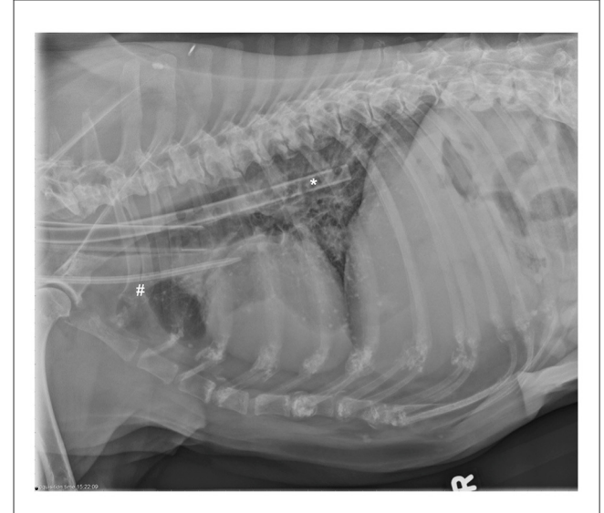
FIGURE 1 Right lateral thoracic radiographs confirming termination of the jugular catheter (labeled #) in the region of the cranial vena cava and right atrium. A radiopaque esophageal feeding tube (labeled *) is also present, terminating at the level of the lower esophageal sphincter.

Two weeks into outpatient hemodialysis management (11 total treatments) the patient presented for scheduled hemodialysis therapy. Facial and right forelimb swelling was observed. An echocardiogram revealed no significant abnormalities, however based on the clinical presentation, catheter associated thrombosis