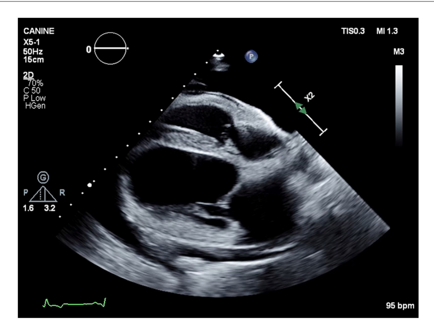
FIGURE 4 Echocardiographic image (right parasternal four chamber view) showing severe anechoic pleural effusion and mild anechoic pericardial effusion.