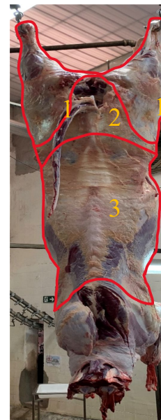
FIGURE 2 Description of carcass divisions in determining the location and score of bruises in cattle. (1) Thigh region; (2) sacral region; and (3) lumbar region.

The pH measurements were performed on 15 carcasses per lot, randomly chosen, using a pH meter (Orion 210A), with a penetration of 5 cm in depth, in the Musculus longissimus dorsi , between the 11th and 13th intercostal space, considering two different times, before and after cooling, 45 min and 24 h after placing in the cold chamber, respectively. The mean temperature after 45 min was 33.5^{\circ}\text{C} \pm 2.98 and after 24 h 0.4^{\circ}\text{C} \pm 0.32 .