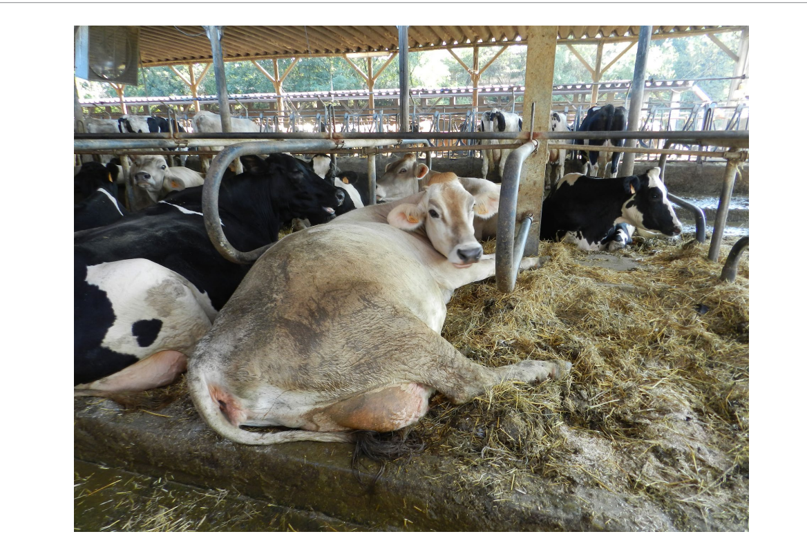
FIGURE 2 Cow in a comfortable resting posture, with stretched legs

The average levels of activity synchronization are low, both for feeding (58%) and for lying (47%) (Table 3), compared to the levels