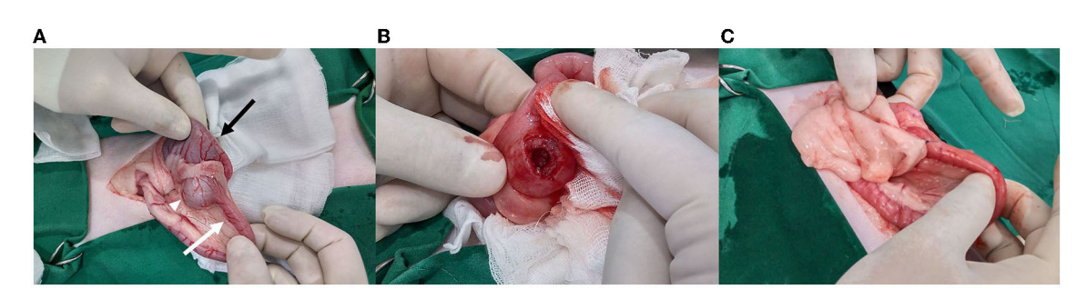
(A) A round, firm mass (arrowhead) identified at the distal end of the ileum (white arrow) very close to the ileocolic junction. The mass is located at the mesenteric border of the distal ileum. The colon (black arrow) is grossly normal. (B) A hole was made to drain the contents of the mass and to flush the inside of the mass. Further removal of the mass was performed. (C) Omentalization performed to secure the omentum to the lesion by simple interrupted sutures.

previously reported cases of enteric duplication cysts associated with the small intestine in feline patients, surgical management involved subtotal resection with preservation of the adjacent small intestine (2, 3, 16, 19, 21). Considering that the mass was located in the duodenum in all five cases, it is assumed that subtotal resection of the mass was performed to preserve the bile and pancreatic ducts. Among the three cases wherein complete resection was performed, the mass in 2/3 cases was located in the jejunum (5, 15). However, in the remaining case, although the mass was located in the duodenum, complete mass resection was performed without complications, likely because the mass was located 3 cm caudal to the duodenal papilla (20). In this case report, subtotal resection was chosen rather than complete removal of the mass because the mass was adjacent to the ICJ. The ICJ regulates intestinal transit, allowing the intestinal contents to move intermittently from the ileum into the colon to ease nutrient absorption. The ICJ also prevents retrograde reflux from the colon into the ileum due to