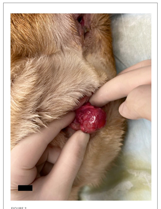
Photo of the clitoral mass four weeks later at presentation to the Theriogenology Service. The mass was noted to be \sim 2 \times 2 cm, multi-lobulated, and associated with the clitoris but not involving the urethra. It was determined on ultrasound to have cystic areas. The scale bar in the bottom left corner of the photograph denotes 1 cm.

Histopathology of the mass revealed an unencapsulated, infiltrative, nodular, densely cellular mass. The mass was composed of cells that formed sheets, tubules, and rosettes supported by a moderate amount of fibrous stroma (Figure 3). Cells were medium-sized and cuboidal with a moderate amount of eosinophilic cytoplasm. Nuclei were medium-sized and round with clumped chromatin. There were 15 mitotic figures per ten 400x fields (1.5 mitotic figures per high power field). Small areas of necrosis were noted scattered throughout the mass. The overlying epithelium was noted to be multifocally ulcerated. Moderate numbers of neutrophils had infiltrated the ulcer beds. The deep margin of the specimen was noted to have a stalk of fibrovascular tissue with 3 mm of normal tissue. A diagnosis of canine clitoral adenocarcinoma was made. Excision appeared to be complete; however, due to the invasive nature of the mass and high mitotic rate, recheck appointments for local recurrence and/or metastasis were recommended.