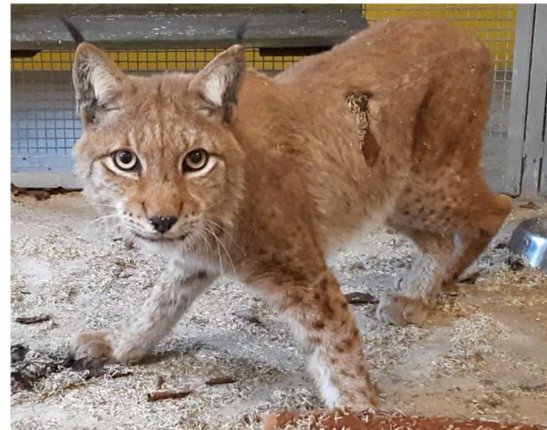
FIGURE 1 Lynx showing a broad based stand of the front limbs and crossed hind limbs due to ataxia.

A 3 year old, male, free ranging Eurasian lynx ( Lynx lynx ) was found in an urban area in Hesse (Taunus) lacking escape reflexes, even when approached by humans. The animal was brought to a wildlife rescue and conservation center for observation. Clinically, the lynx was atactic (see Supplementary Videos 1, 2 ), with a broad based stand of the front limbs and crossed hind limbs ( Figure 1 ). Furthermore, he showed apathy and a flea infestation. An X-ray investigation as well as a blood examination displayed no further abnormalities. In addition, the animal was tested for different infectious agents. ELISAs detecting feline leukemia virus (FeLV) antigen as well as feline immunodeficiency virus (FIV) and feline coronavirus (FCoV) antibodies were negative. IgG-antibodies against Toxoplasma gondii could be detected by an indirect immunofluorescence test (Titer: >1:1,024). The lynx was brought to