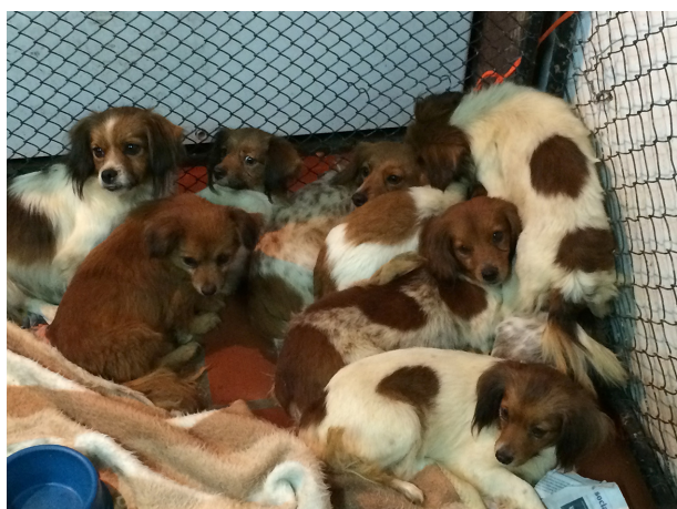
FIGURE 1 Dogs found at the household.

Despite efforts, no further information was obtained about the deceased, even from adjacent neighbors, who just confirmed the elderly individuals’ reclusiveness, self-isolation, lack of self-hygiene, and presence of multiple dogs. Available police reports lacked such information as well. As no previous complaints were made, no records were found in the city services either, as no specific active service existed at the time. In fact, the city (animal and object) hoarding taskforce responsible for surveying, mapping, monitoring, and prevention was only created in 2015, in response to this and other tragic outcomes, including a woodhouse fire by a candle (unpaid electric power was cut off) where a single elderly woman lived, killing 43 dogs indoors and releasing around 40 dogs on the streets (21). Even after the establishment of the city taskforce, animal hoarding remained a difficult diagnosis, as psychiatric confirmation could take months to years, due to the refusal of patients to attend medical appointments, lack of psychiatrist’s agenda to visit patients at their households, and the need of a sequence of appointments to exclude other potential