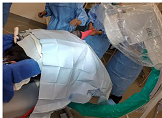
FIGURE 1 Visualization of patient position. Dorsal recumbency at the level of the withers with pelvis tilted toward a right lateral recumbency. The back half of the calf is on a radiolucent plexiglass table extension that allows intraoperative fluoroscopic imaging.

Four calves were presented to the ISU LVMC for FCPF that received MIO Steinman pin internal fixation repair between 2020 and 2021 with individual case information and outcomes recorded below. Radiographically FCPF was diagnosed in the lame limb with no evidence of acetabular or femoral