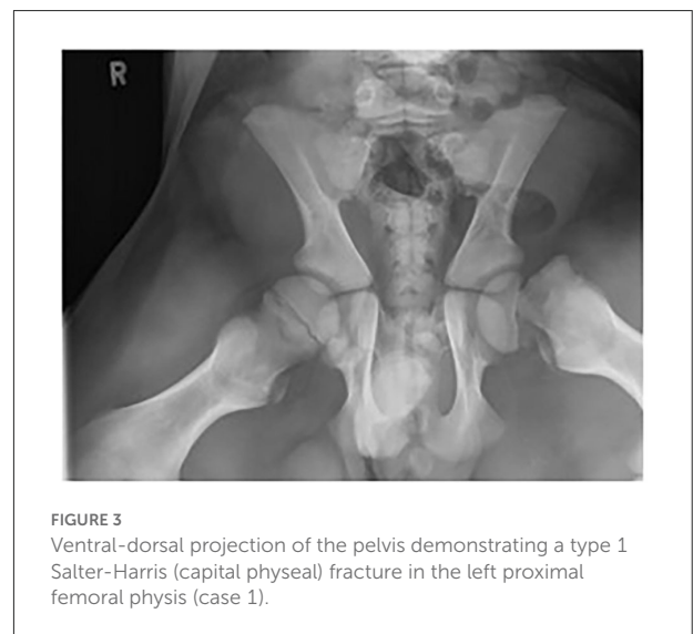
FIGURE 3 Ventral-dorsal projection of the pelvis demonstrating a type 1 Salter-Harris (capital physeal) fracture in the left proximal femoral physis (case 1).

A 21-day-old mixed breed beef bull (BWT = 55 kg) was presented with a 20-day history of left hind limb lameness. History included dystocia resolved through cesarean (C-)section delivery, and left hind limb non-weight bearing lameness was observed the following day. The owner treated the calf with transdermal flunixin meglumine for 20 days before hospital