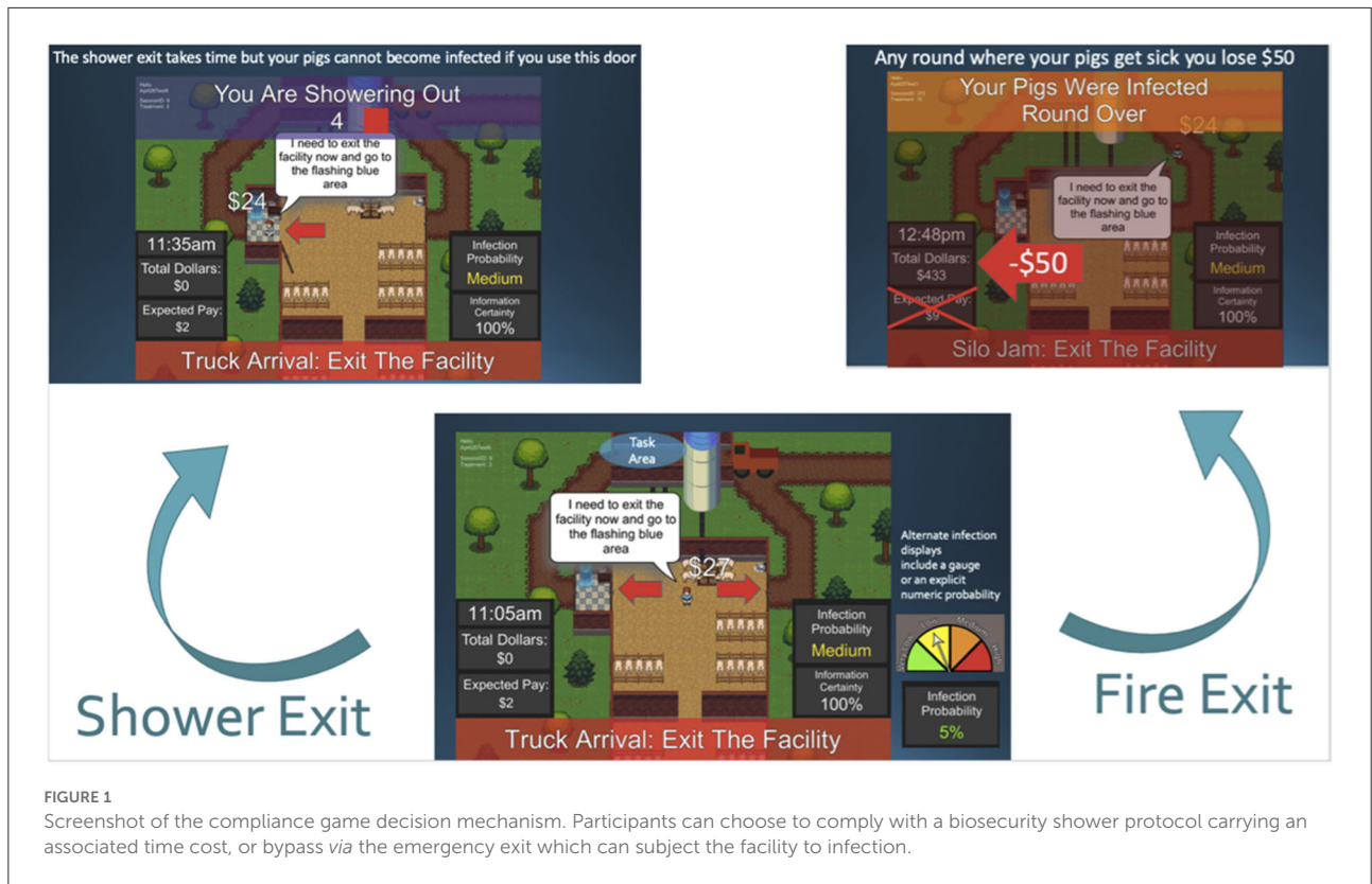
FIGURE 1 Screenshot of the compliance game decision mechanism. Participants can choose to comply with a biosecurity shower protocol carrying an associated time cost, or bypass via the emergency exit which can subject the facility to infection.

immerse participants within the simulated decision mechanism, so these were not pertinent for quantifying risk.