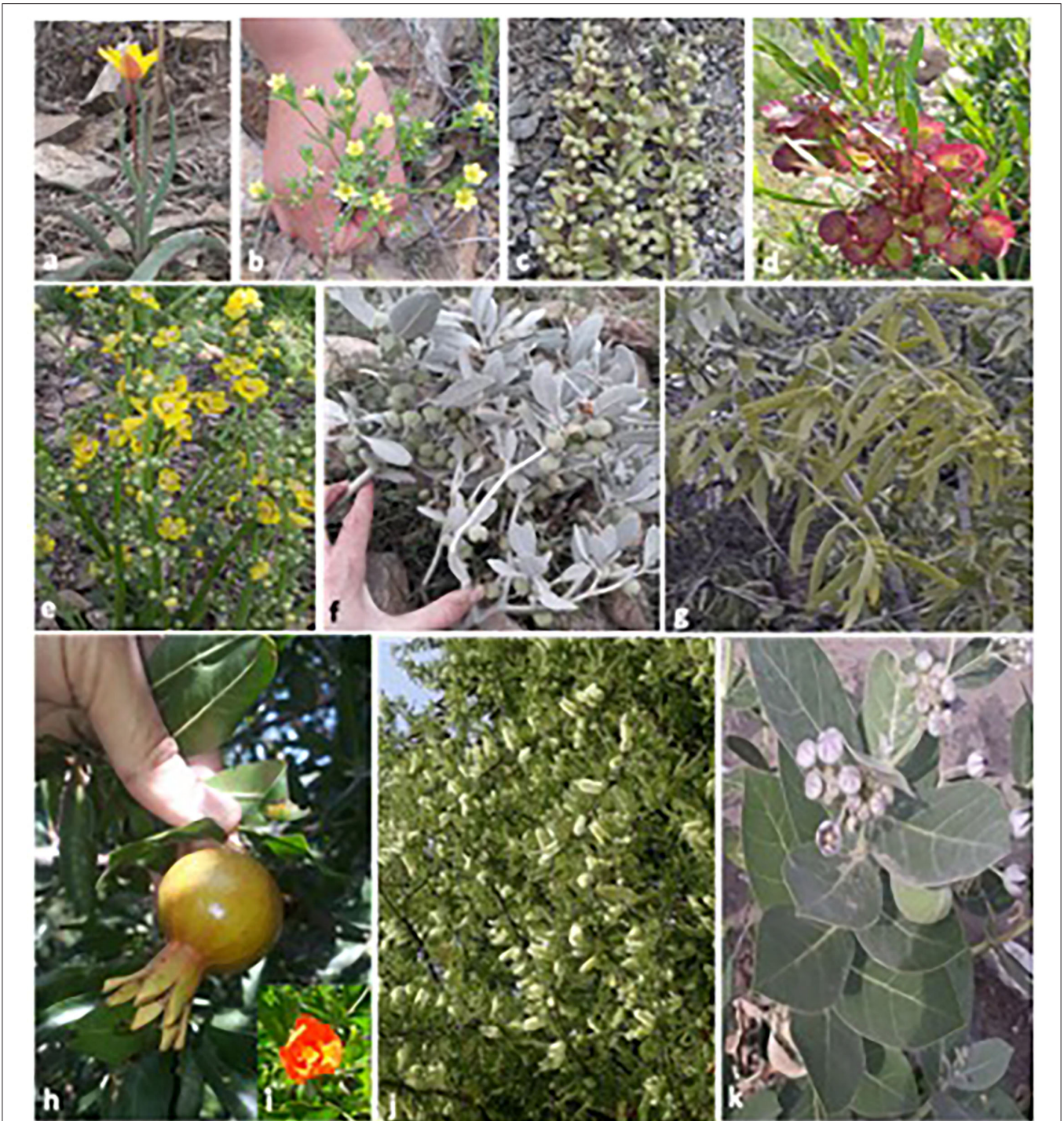
FIGURE 2 | Photographs of some ethnoveterinary medicinal plant species of the study area.

first to investigate the entire ethnoveterinary practices of North Waziristan, Pakistan, where indigenous people have extensive traditional knowledge and rely heavily on medicinal plants to treat livestock ailments and supplement their income. This study might be beneficial to fill the gap that might have