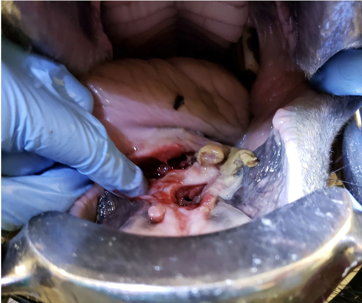
FIGURE 2 Image of the intra-oral lesion on day 11 (treatment day 2) after initial presentation

and gentamicin in combination are commonly used to treat osteomyelitis in horses until definitive culture and sensitivity results are known (19). The use of antimicrobial-impregnated polymethylmethacrylate (AIPMMA) implants for prevention and treatment of osteomyelitis in horses has drastically improved the success rate (19). Common complications of AIPMMA implants have been soft tissue damage during removal and the formation of fibrous connective tissue complicating removal (19). Additionally, AIPMMA should not be placed in joints due to its abrasive nature on cartilage (19, 20). It is possible that use of P407 Gel on exposed bone and implants prior to closure, and within joints, could provide prolonged anti-microbial prophylaxis, decreasing the development of osteomyelitis post operatively. Furthermore, a study using isolated autologous chondrocytes, polyglycolic acid, and P407 gel successfully in vivo -engineered hyaline cartilage and repaired