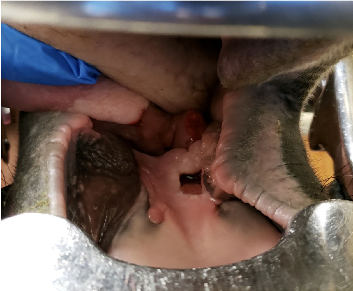
FIGURE 3 Image of the intra-oral lesion on day 23 (treatment day 14) after initial presentation

Limitations of this case report include a lack of comparative studies between PGKPG and free penicillin G. The ability and length of time of release of penicillin G from PGKPG was also not evaluated, however the horse was discontinued from systemic antimicrobials on day 10 of hospitalization and the wound did not regress while using the PGKPG despite constant contamination from the oral cavity. These limitations require further evaluation for the use of PGKPG in other clinical settings.