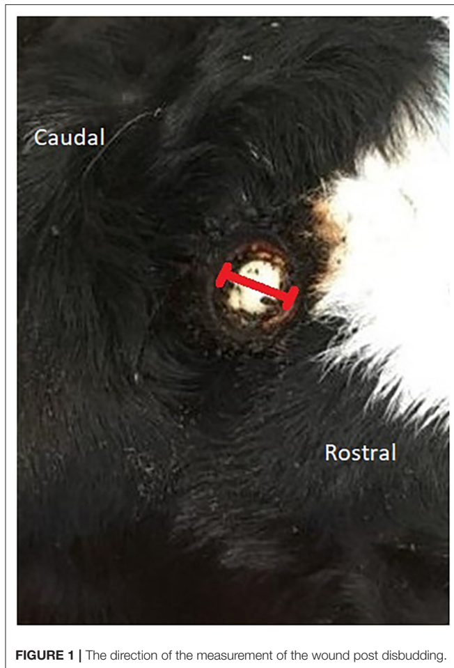
FIGURE 1 | The direction of the measurement of the wound post disbudding.

and Tucker (3) and the lesion score system by Huebner et al. (6). Abnormal healing was classified as any lesion with a dry or moist purulent discharge. The lesion scores were classified as either healed (H, Figure 2A ), normal healing (NH, Figures 2B,C ), or abnormal healing (AH, Figure 2D ).