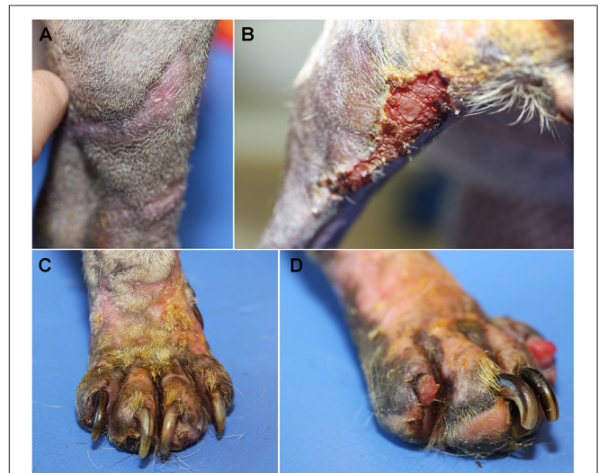
FIGURE 3 | Clinical examination after 3 weeks. Healing was complete along the distal limbs (A), crusty inflammatory lesions were observed on the back of the left thigh (B) and the extremities, particularly around the claws (C). Onychomadesis was observed on digits II and IV of the left hind foot (D).

After 3 weeks from starting doxycycline, the improvement was excellent, the distal limbs had completely healed (Figure 3A) but some crusty and inflammatory lesions were observed on the back of the thigh (Figure 3B) and the extremities, particularly around the claws (Figure 3C). Onychomadesis was observed on digits II and IV of the left hind foot (Figure 3D). Cytological