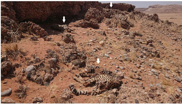
FIGURE 1 | Two of the three cheetah male carcasses (left and middle arrow) as found 11 days after they died. The carcass of the third animal was found approximately 10 meters away behind a rock (right arrow).