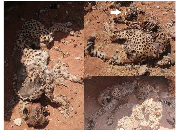
FIGURE 2 | Close up of the carcasses of the three cheetahs. These pictures were taken during the second visit, 22 days after the estimated time of death. Note the GPS collar on the neck of the upper right cheetah pointed out by a white arrow.