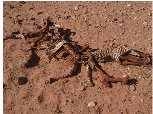
FIGURE 4 | Carcass of the anthrax positive mountain zebra which the cheetahs fed on <24 h prior to their death. The picture was taken during the first field inspection, 11 days after the estimated cheetah death.

Previous observations have shown that bacterial cultures from highly susceptible animals that die quickly, such as cheetahs, are often anthrax negative by bacterial culturing as they die at