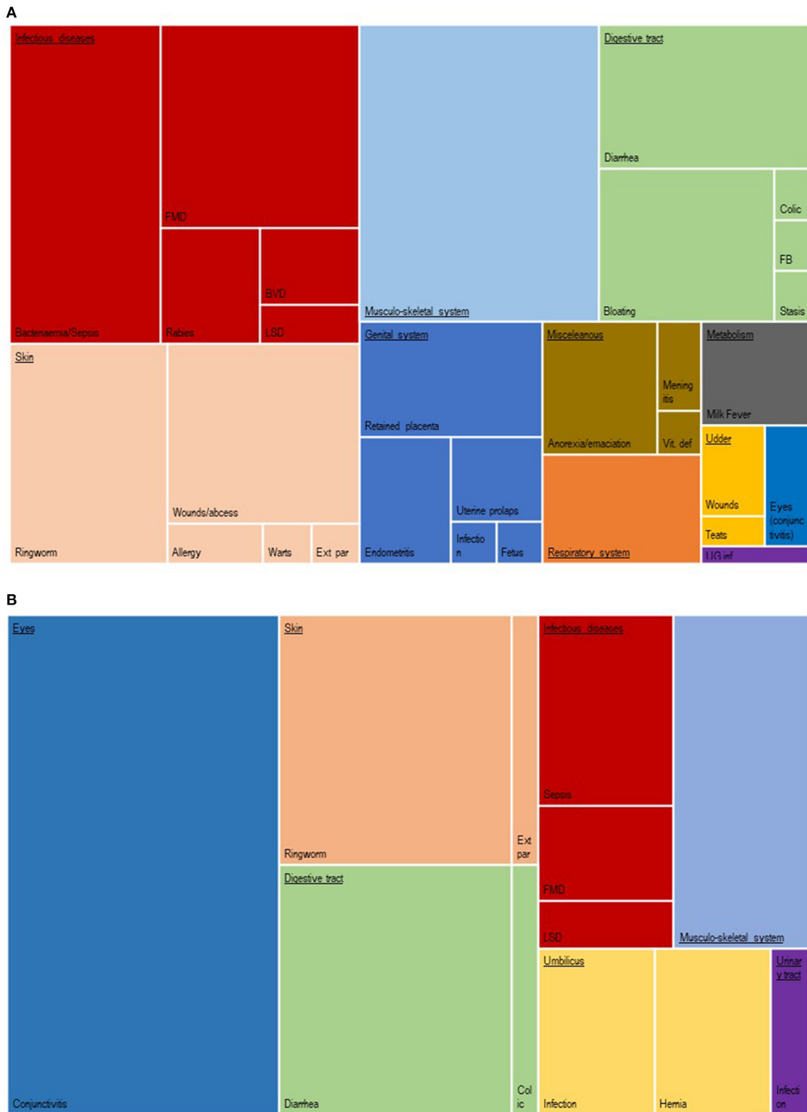
FIGURE 2 | Detailed health problems as recorded in 288 animals ( A in 225 replacement/breeder animals; B in 63 young stock).