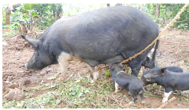
FIGURE 2 | Tethered sow with piglets in Uganda (picture credit: Michel Dione, ILRI).