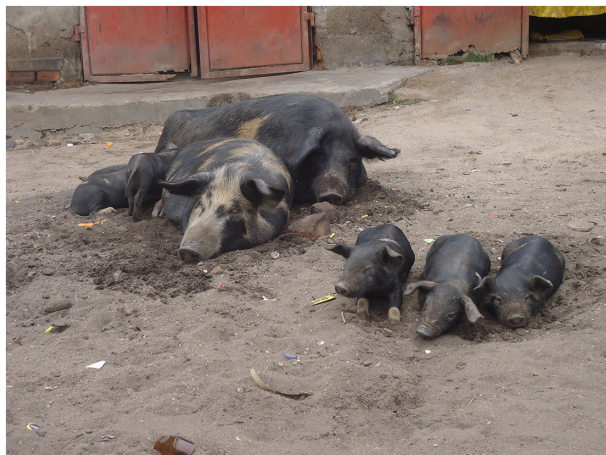
FIGURE 4 | Free-ranging pig in Uganda.

serum for 15 weeks (77). During an outbreak investigation in the central region in Uganda, ASFV was isolated from tissues of pigs that had died from ASF (78), suggesting that feeding pigs with contaminated materials or undercooked pork can predispose the animals to the disease. However, practices like processing swill by heating can kill the virus and consequently decrease the risk of virus transmission to healthy pigs. Niederwerder et al. (79) demonstrate that ASFV can easily be transmitted orally (although higher doses will be required for infection to occur through plant-based feed). In 2014, the introduction and spread of ASFV in Latvia was associated with failure to use simple biosecurity measures notably the feeding of virus-contaminated fresh grass or crops to naive pigs (80). It has also been demonstrated that ASFV can survive in feed ingredients (under simulated transboundary shipping models) (81) suggesting that ASFV spread might be attributed to less-recognized transmission routes such as feed or water (79). In smallholder systems, pig feeding strategies generally depend on availability of the feed resources and the ability of farmers to buy ingredients, which often are expensive. Financial constraints can lead to sub-optimal feeding practices, hence the risk for ASF can increase.