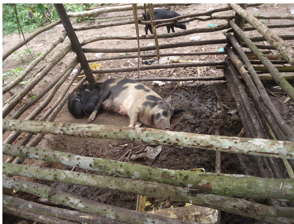
FIGURE 3 | Housed sow with piglets in Uganda.