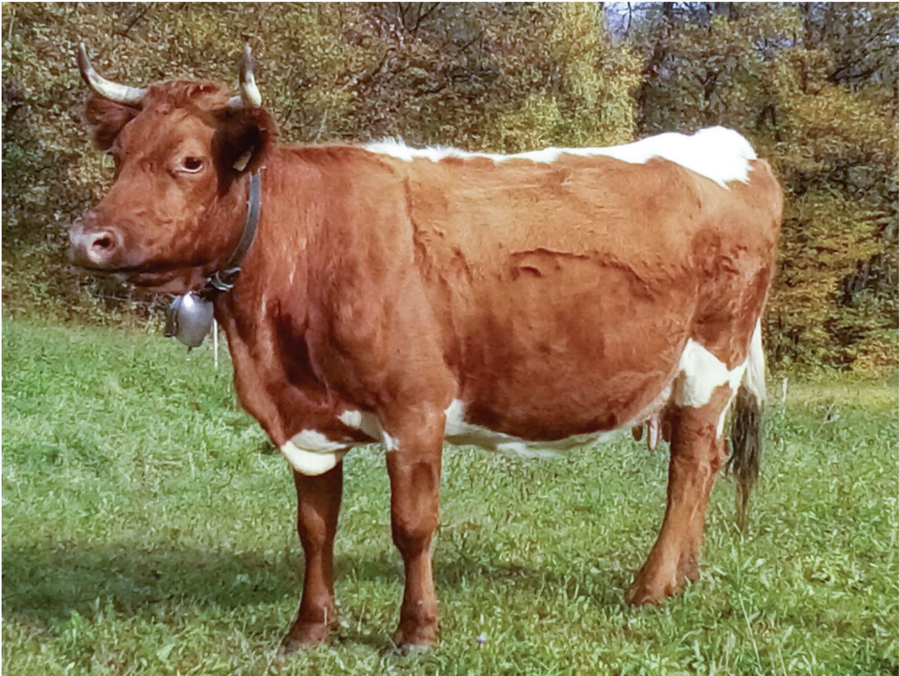
FIGURE 2 | Autochthones Slovenian Cika breed.

do not participate in the official programme, they cannot have the official status.