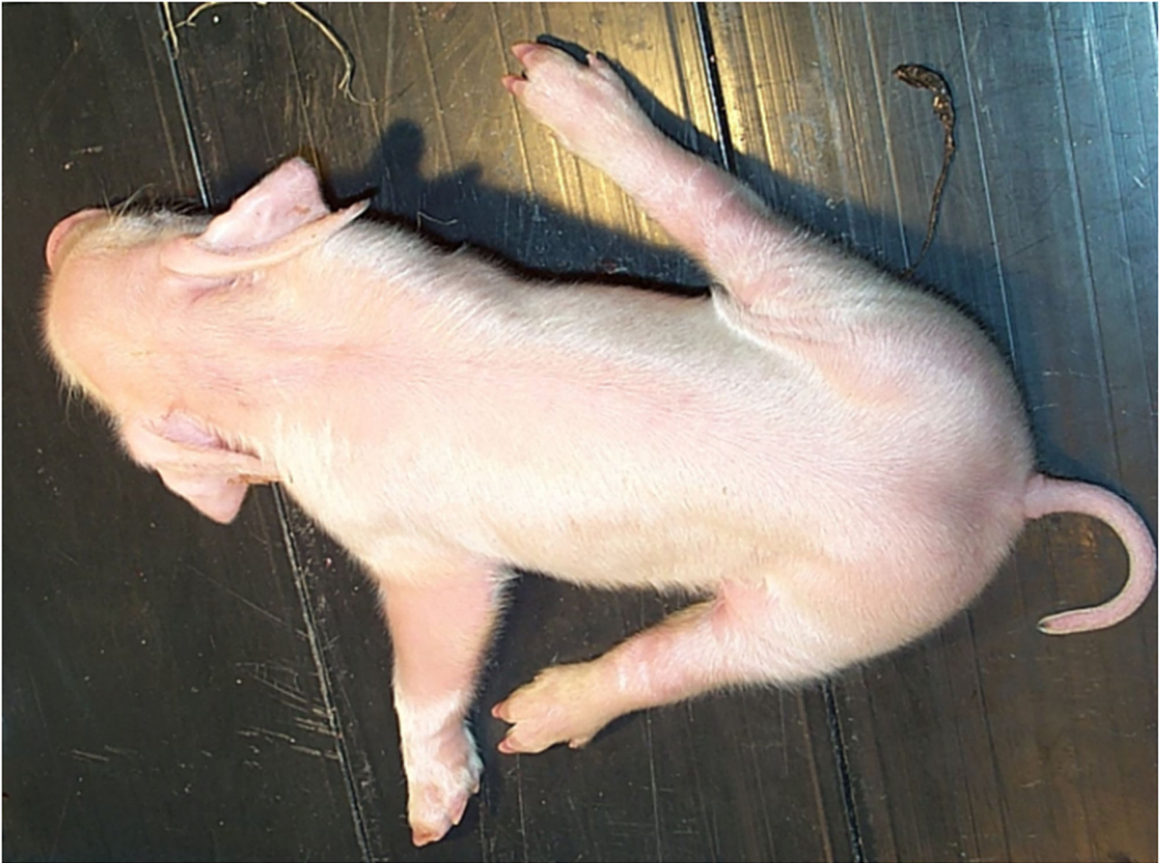
FIGURE 1 | Typical phenotype of a splay leg piglet. The hind legs are splayed sideward impairing the ability to stand and walk. The degree of splaying differs and fore legs are affected in severe cases, too.

A more conclusive study, involving a total of 24 affected piglets and controls and an extensive set of histological methods, was capable of setting up a more comprehensive picture of PCS histology (10). Beside the known MFH, staining for glycogen, ATPase and acetylcholine esterase (ACHE) revealed the presence of impaired muscular differentiation in PCS-affected piglets. In particular, using acid pre-incubated ATPase-reaction, the authors found only small numbers of solitary type I fibers in PCS-affected samples. This points to a striking delay in conversion of type II to type I myofibers, a main component of postnatal muscle maturation. In addition, ACHE-staining showed clear differences between larger, well-organized motor endplates in controls compared to smaller and more chaotically organized ones in splay leg samples (10).