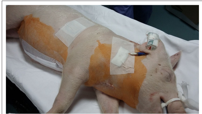
FIGURE 1 | The pig at the end of the procedure. The FTP 75 µg/h was covered with a surgical adhesive dressing. It was planned to be left in situ until the end of experiment at Day 8, but it had become dislodged and was presumably ingested at the most 4 h before the signs of intoxication were observed on Day 5. FTP, fentanyl transdermal patch.

Abbreviations: FTP, fentanyl transdermal patch.