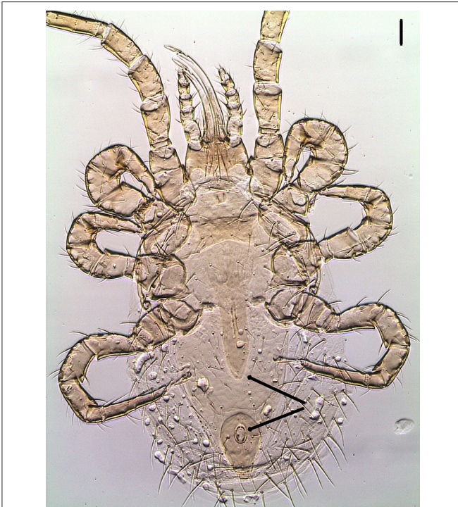
FIGURE 2 | Ventral view of Ornithonyssus bursa adult female showing the posteriorly narrowed genitoventral shield (upper arrow) and the teardrop-shaped anal plate with anal opening at the anterior end (lower arrow). Scale bar: 50 \mu m.