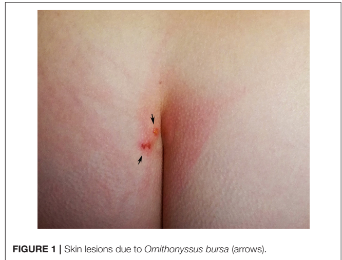
FIGURE 1 | Skin lesions due to Ornithonyssus bursa (arrows).

A 51 years old woman contacted the parasitology laboratory of INIAV (Instituto Nacional de Investigação Agrária e Veterinária) for advice on a possible bird mite infestation. The woman reported that she and her 16 years old daughter, who lived in the same apartment, located in the residential area of Oeiras, had been suffering from pruritic erythematous papules of unknown origin, which occurred continuously, with more or less intensity, over a period of 4 months (February-June 2019). The lesions were located primarily in the pelvic, gluteal, coccygeal ( Figure 1 ), and perineal regions, under the breast, and to a lesser extent on the neck, wrists and torso. The intense pruritus and consequent scratching of some papules resulted in wide inflamed skin areas. Lesions were particularly intense and painful around the waist. Bothers occurred habitually at night, but were also noticed during daytime, in which case the waistline was the most affected area. Pruritus was described as severe and prolonged in time and exacerbated by increasing temperature, including by contact with hot water, e.g., while showering or washing the dishes. An initial search in the apartment had not revealed any arthropods visible to the naked eye. After some months, in which no source of dermatitis was found, the mother, who had