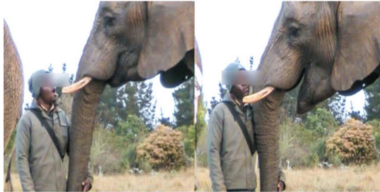
FIGURE 1 | Contagious yawn sequence. The handler yawns in the left panel, quickly followed by a contagious yawn from the focal elephant in the right panel. A video of this sequence is available in supplemental materials ( Supplementary Video 3 ).

the initial handler yawn and the elephant's contagious yawn. The mean duration of the contagious yawns from the elephants was 6.8 s, which is consistent with the duration of spontaneous yawning observed in this group of elephants.