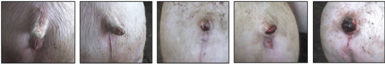
FIGURE 2 | Tail lesion scoring system adapted from Kritas and Morrison (20) and Harley et al. (37). (Scores 0–4, left to right). (0) No evidence of tail biting—clean, white unblemished tail; (1) Superficial disruption of the skin of the tail tip and/or light to darker brown marks along the length of the tail but no obvious evidence of teeth marks/puncture wounds on the tail; no swelling, no necrotic tissue; (2) Evidence of teeth marks (puncture wounds) on the tail tip and/or length; characterized by disrupted epidermis and redness but no evidence of swelling; (3) Evidence of teeth marks/puncture wounds (chewing); disrupted epidermis with redness and swelling but no necrotic tissue; (4) Open wound on the tail or where tail used to be; redness, swelling and necrotic tissue evidenced by yellowish (pus) slough or eschar (dry, black, hard necrotic tissue).

from 101 pigs with tail lesions scored as 0-1, 51 pigs with tails scored as 2, 51 pigs with tails scored 3, and 66 pigs with tails scored 4. In all experimental days, pigs with the five different tail lesion scores were scored and imaged. All study pigs were imaged at the two locations (at the base of the tail and the ear).