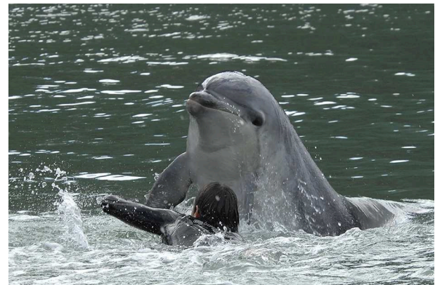
FIGURE 6 | “Moko” being pursued by a swimmer in Whakatane, New Zealand.

day, 59 “Dolphie,” “Beaky,” and “Simo” in Wales were known to have swum and played with dogs (4) and Figure 5 shows a dog approaching “Moko” in New Zealand.