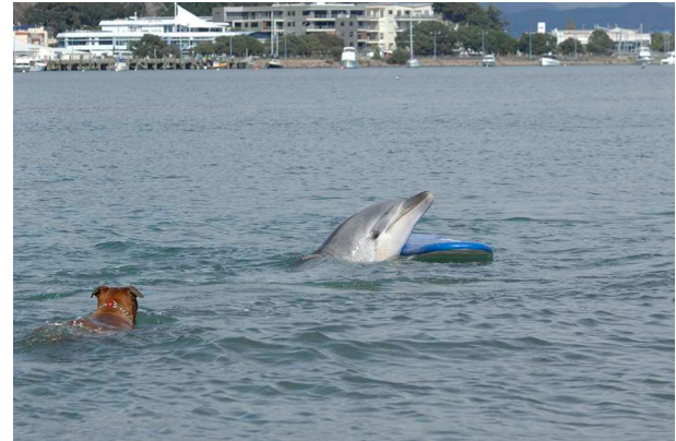
FIGURE 5 | “Moko” with a surfboard he had “stolen” and a dog swimming after him.

There are also cases of solitary dolphins interacting with domestic animals. “Dougie,” in Ireland, for example, regularly interacted with a pet dog who would swim with him every