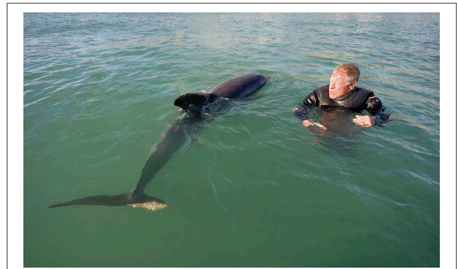
FIGURE 4 | After “Dave” received a severe wound to her tail, attempts were made to give her fish laced with antibiotics.

Bejder et al. (34) noted that when wild animals become habituated to contact with humans it can lead to negative