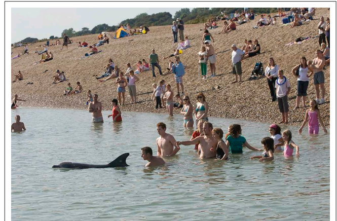
FIGURE 3 | Large numbers of people traveled to see “Dave” and to interact with her.

It is distinguished from Wilke et al.’s Stage 1 animal that has established a home range.