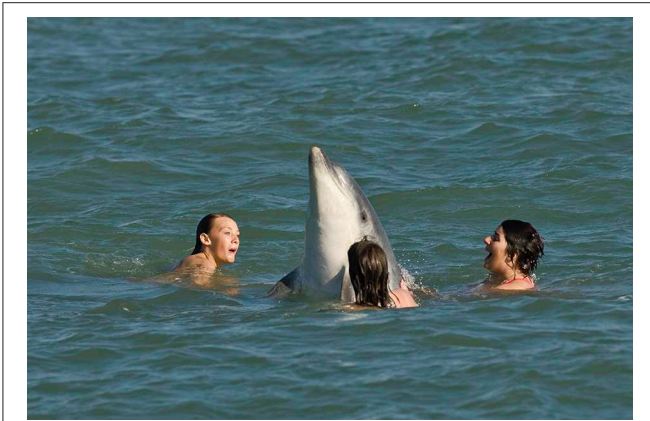
FIGURE 2 | “Dave” the solitary-sociable dolphin, interacting with a group of people in Kent, UK.