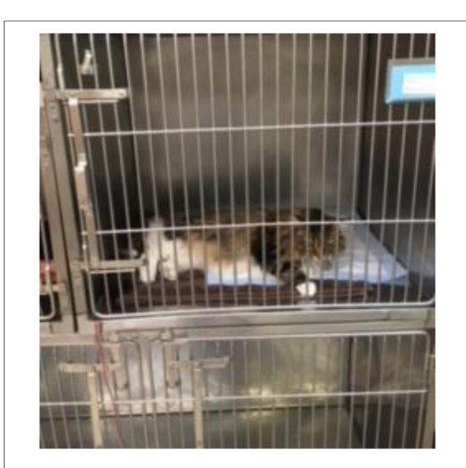
FIGURE 3 | FUS risk factors through the lens of the AA model: is body weight or body frame size the real factor?. Viewed through the lens of the AA model, risk factors for FUS take on slightly new meanings. For instance, many epidemiological studies have determined that high body weight (>5.8 kg) is a risk factor. Although this has often been interpreted to reflect excess actiposity and sedentary lifestyle, this has never been proven. It is just as likely that the high weights are a function of larger than average body frame size . This in turn, may be determined by total androgen exposure during development, which, along with neutering, may make very large male cats exceptionally vulnerable to later FUS and urethral obstruction, perhaps due to higher concentrations of androgen receptors in cells of urogenital tissues.

neutered cats. But there is currently no test for DHEA or DHEA-S. A complete test of the AA model would involve attempting to answer a wide range of questions, from very basic to clinical. As very little is known about AA dynamics in any species, except perhaps for human beings (41), the variety of feline studies that might be undertaken is practically unlimited. However, we have had a few relatively straightforward ideas for testing. The two main approaches we have considered are to: (1) probe AA and AR involvement directly in cats, or a more indirect approach, (2) to design an intervention aimed at blocking AA and to see if that alters the usually natural history of FUS, particularly with obstruction.