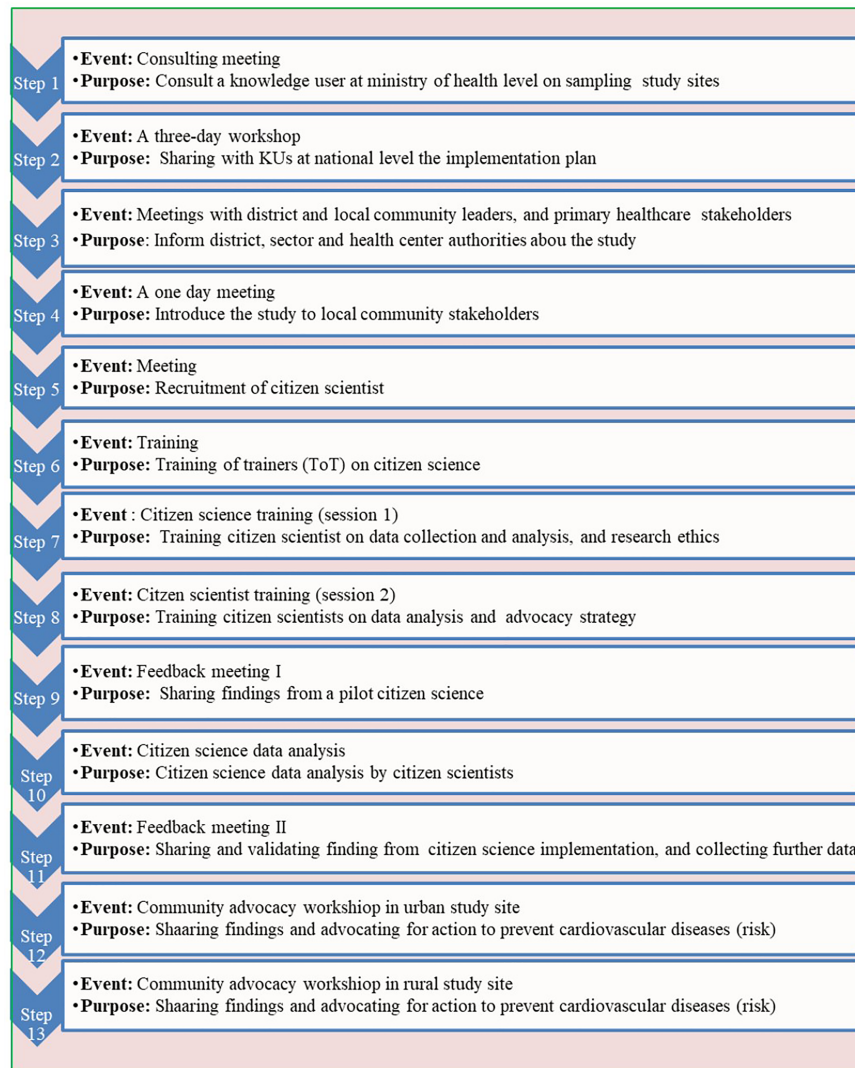
FIGURE 2 | Steps of citizen science implementation.

meeting to introduce the study to a wide range of community leaders and PHC stakeholders. The outcomes of these one-on-one meetings were that conducive environment of data collection was created and ensured as local (district and sector level) authorities and PHC stakeholders accepted to engage their subordinates and/or local community residents into the study.