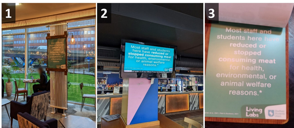
FIGURE 3 Examples of the descriptive dynamic social norm message in different research sites of study two; Panel 1. Poster at site A; Panel 2. Digital signage at site B; Panel 3. Menu clipboard at site B.

Related to survey recruitment, it is important to highlight two changes that were made to the design of study one. First, due to COVID-19 and safety concerns, in-person survey participant recruitment was avoided, and adverts containing QR codes were used. Second, in an attempt to keep surveys temporally close to the intervention whilst minimising effects on purchasing behaviour, the QR adverts and survey were live for only the final two days of the post-intervention phase.