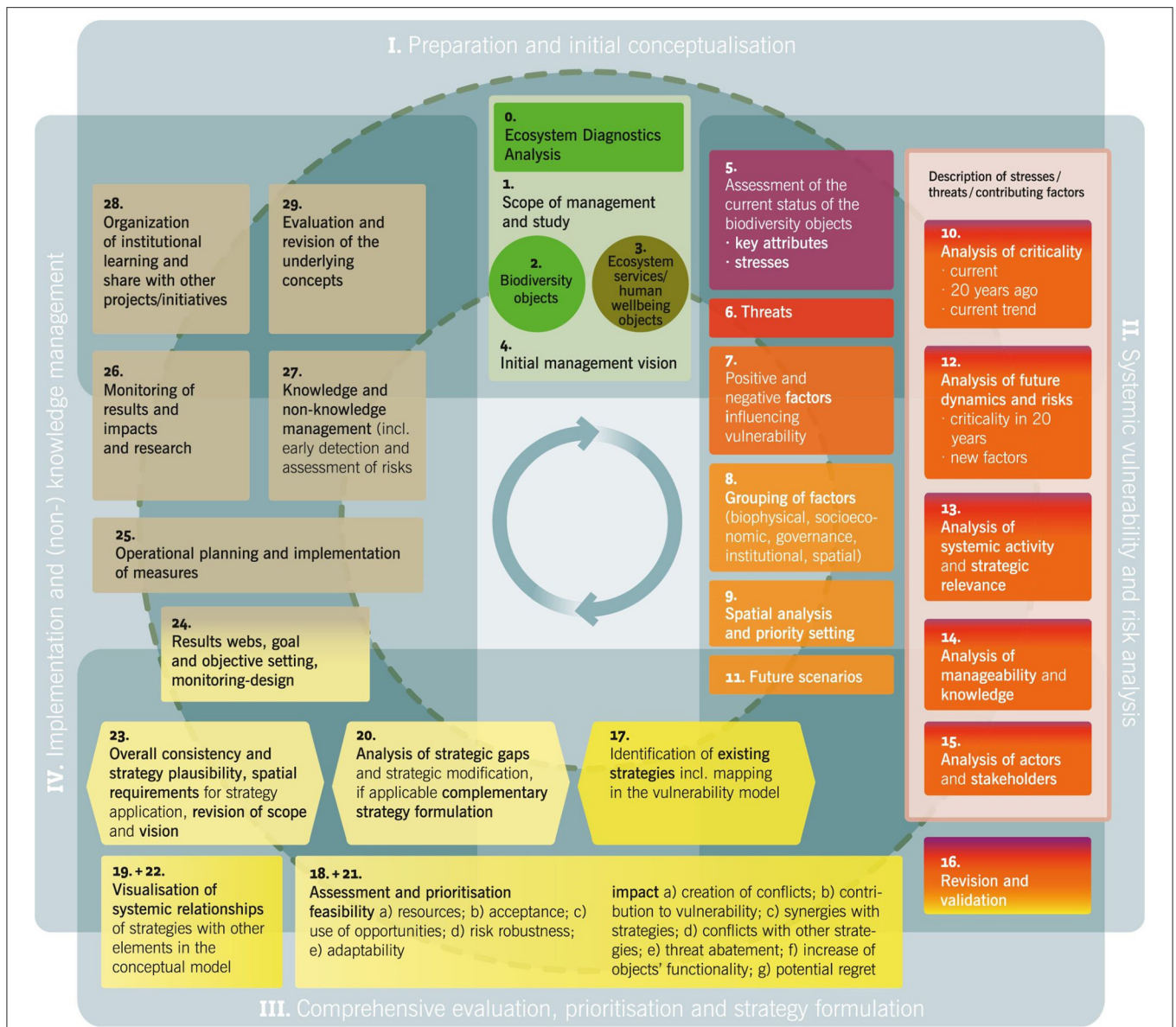
FIGURE 1 | The four phases of the MARISCO cycle: (i) preparation and initial conceptualization, (ii) systemic vulnerability and risk analysis, (iii) comprehensive evaluation, prioritization and strategy formulation, and (iv) Implementation and (non-)knowledge management. See Figure 3 for an indication of the steps applied during our participatory assessment in Tajikistan.

and prioritizing strategies to address the identified problems on the basis of a second participatory workshop. The workshop starts with a revision of the systemic knowledge map and the outcomes of the problem analysis and rating. This is followed by several steps related to situating and evaluating existing problem-solving strategies of governmental and non-governmental actors, identifying gaps, and developing complementary or alternative strategies as well as systematically assessing their anticipated outcome based on cause-effect mapping and rating exercises (see also Schick et al., 2018).