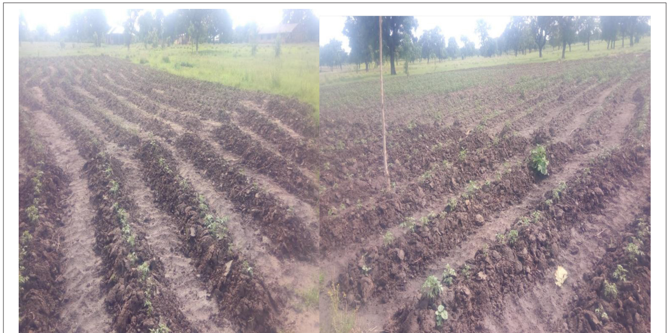
FIGURE 3 | Terracing as climate-smart agricultural practice identified in all the four study communities. Terracing is one of the oldest methods of managing soil and water—an agricultural practice, which involves collecting surface runoff water (thus increasing the infiltration and controlling water erosion known from ancient history) to transform landscape in hilly or mountainous regions or areas. Terracing is important for its considerable reduction in soil and water erosion, thus, if correctly planned, constructed, and properly maintained. However, terracing, if not properly maintained, could cause land degradation.

***Denotes significant at 1% level, **denotes significant at 5% level, and *denote significant at 10% level. Values in parenthesis are percentages.