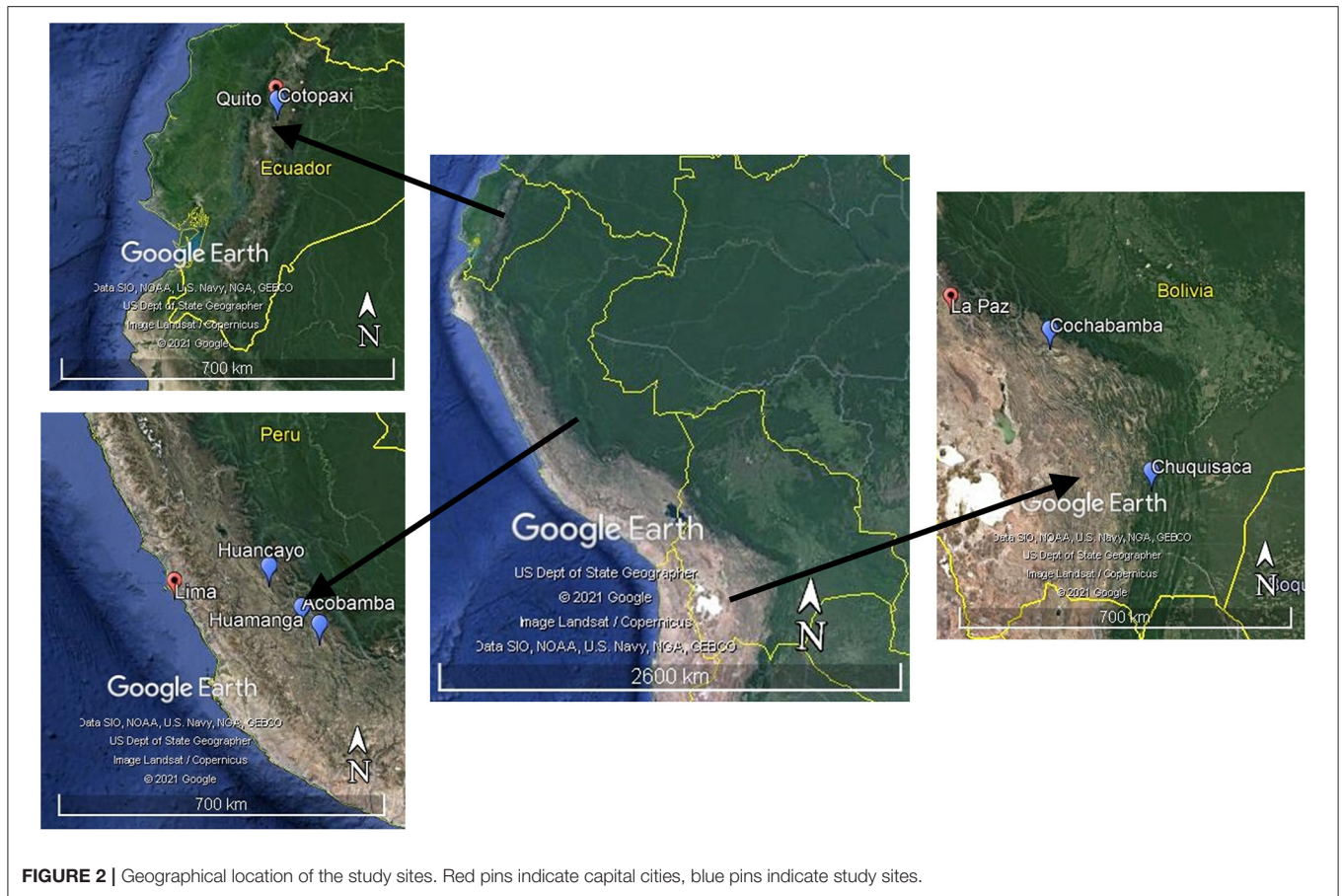
FIGURE 2 | Geographical location of the study sites. Red pins indicate capital cities, blue pins indicate study sites.