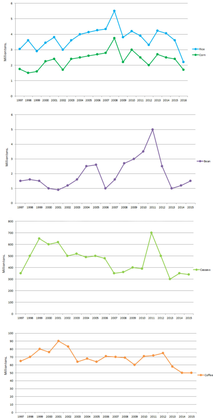
FIGURE 1 | Production of principal crops in Venezuela in the period 1997–2015.