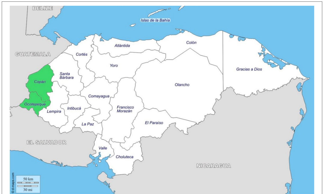
FIGURE 1 | Area of intervention (Copan and Ocatepeque).

resources has been found to strengthen women's bargaining position in the household (Quisumbing, 2003; Doss, 2013; Quisumbing et al., 2015; Anderson et al., 2017). Since land is an important, if not the most important productive resource, women's access to land is a key determinant of empowerment (Sell and Minot, 2018).