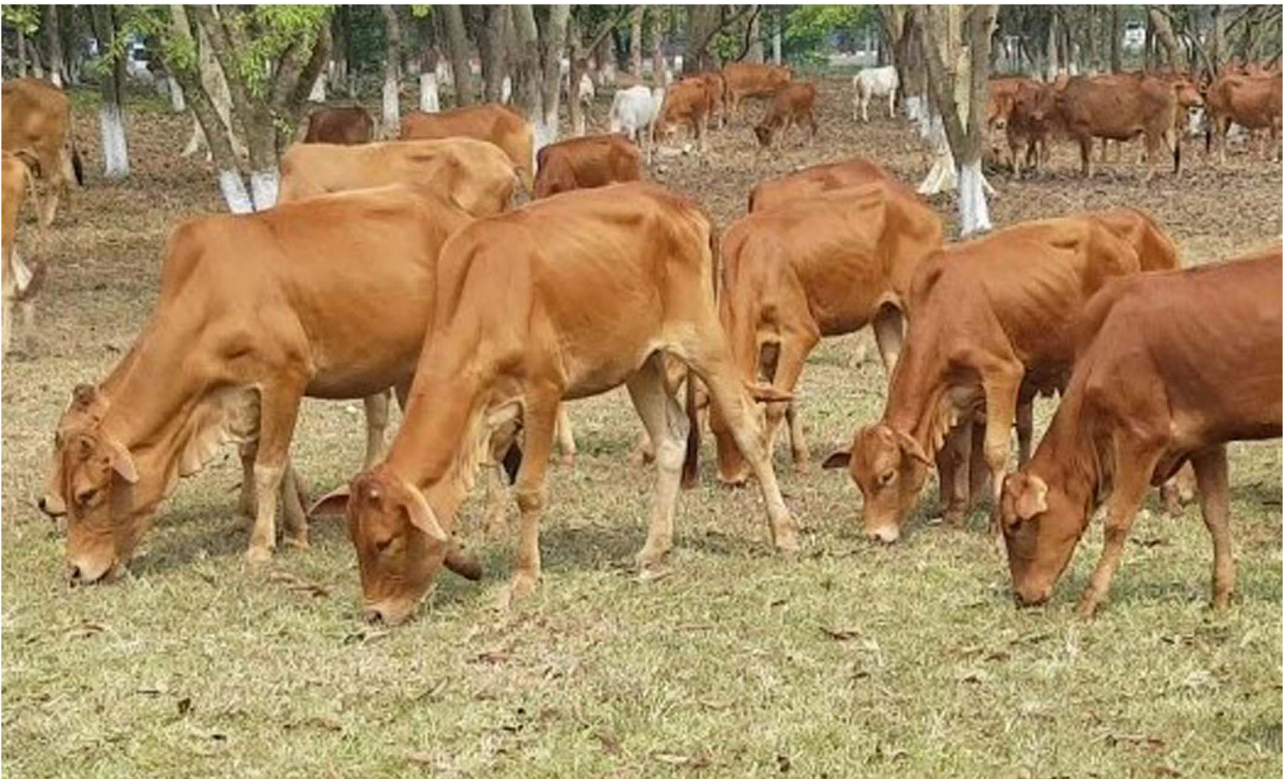
FIGURE 2 | Red Chittagong cattle of Bangladesh.

SD, standard deviation; N, number of articles that reported the parameters. From Afroz et al. (2011), Afroz et al. (2012), Alam et al. (2007), Ferdous et al. (2019), Rabeya et al. (2009), and Rahman et al. (2016).