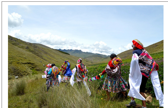
FIGURE 2 | Parque de la Papa community members celebrate the annual festival of “Papa Tinkay,” a ritual offering to the flowering potato plants to bring a fruitful harvest (Agroecology Fund, 2020).

To achieve greater food security and nutrition, sustainability, resilience, and adaptation in this era of global environmental change through conservation, use, and celebration of food-related biocultural diversity, we outline below what we consider to be important, interrelated actions in collaborative research and knowledge sharing, training and capacity development, and networking.