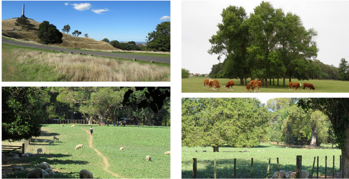
FIGURE 3 | Cornwall Park images, clockwise from top left: Obelisk at the summit of Maungakiekie One Tree Hill, with landscape terracing created during Māori occupation of this former Pā site; Grazing cattle within Cornwall Park surrounded by residential living; Sheep within Cornwall Park finding shade under large specimen trees; Pedestrians use the park to commute between suburbs and avoid the busy roads by creating desire-line tracks through sheep and cattle paddocks.

parking space to park space and forging new public transportation connections privileging the pedestrian experience and increasing the amenity of the park ” (Boffa Miskell and Nelson Byrd Woltz Landscape Architects, p. 15). The final principle of Maanakitanga responds to the need to change, support and provide an enduring vision of the Park.