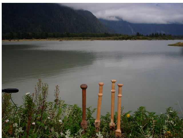
FIGURE 1 | Yew wood digging stick at site of estuarine root gardens, Kingcome Inlet, British Columbia.