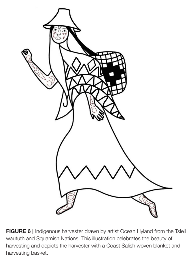
FIGURE 6 | Indigenous harvester drawn by artist Ocean Hyland from the Tseil waututh and Squamish Nations. This illustration celebrates the beauty of harvesting and depicts the harvester with a Coast Salish woven blanket and harvesting basket.

soup featuring lhásem (northern riceroot) bulblets, dandelion fritters, stinging nettle pesto and spanakopita, salmon, elk, moose, deer, and more. This celebration captures a community-based interest and drive to reconnect to plants and other Indigenous foods in the context of health and wellbeing ( Figure 6 ). The celebratory air of the day is empowering and exciting for community members and it is an enjoyable way to gather together and co-create Squamish approaches and definitions of wellness.