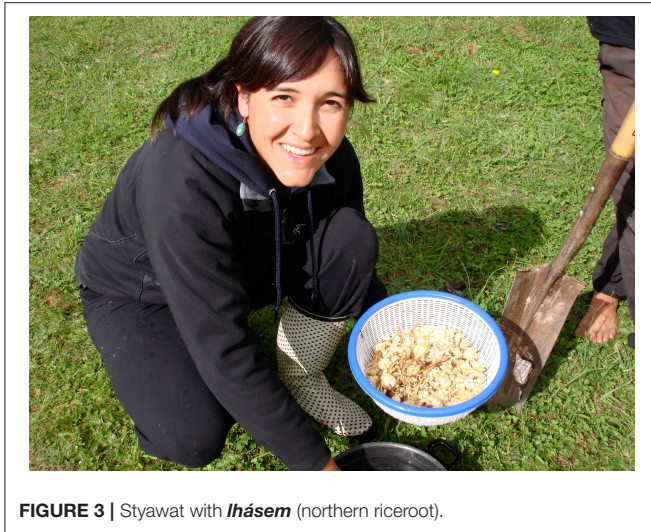
FIGURE 3 | Styawat with Ihásem (northern riceroot).

season also tends to coincide with the dieback of much of the vegetation, which means that when the flooding takes place there is a higher concentration of organic material deposited into these higher regions of the estuary. The detritus supplies nutrients and leads to a nutrient rich environment over time (Deur, 2005).