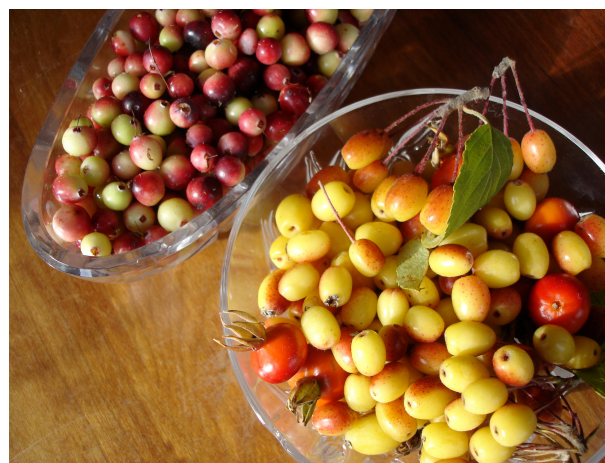
FIGURE 2 | Bog cranberries (top), with Pacific crabapples and a few wild rose hips.

food they would hold in mind. Baskets for harvesting root foods have a looser weave, with stouter weaving elements of split roots and branches, so that water can be washed over the harvested roots to clean them of dirt and debris. Berry baskets are more tightly woven, on the coast often of cedarbark or, in the Interior, birchbark or tightly coiled and stitched cedar roots, so as to contain the berries, whatever their size or juiciness. Many baskets are beautifully decorated through variations in weave, or overlay with different colored materials, showing high regard for the foods they are designed to hold.