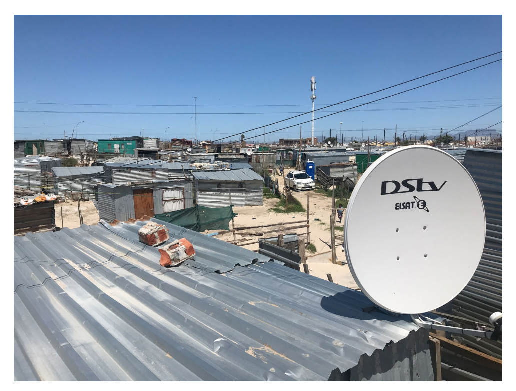
FIGURE 1 Qandu Qandu, Cape Town

The paper is based on a primarily qualitative dataset composed of microgrid project documentation, a baseline survey, and in-depth interviews with Qandu Qandu community members. A qualitative approach was selected given the argument, presented here, of the need