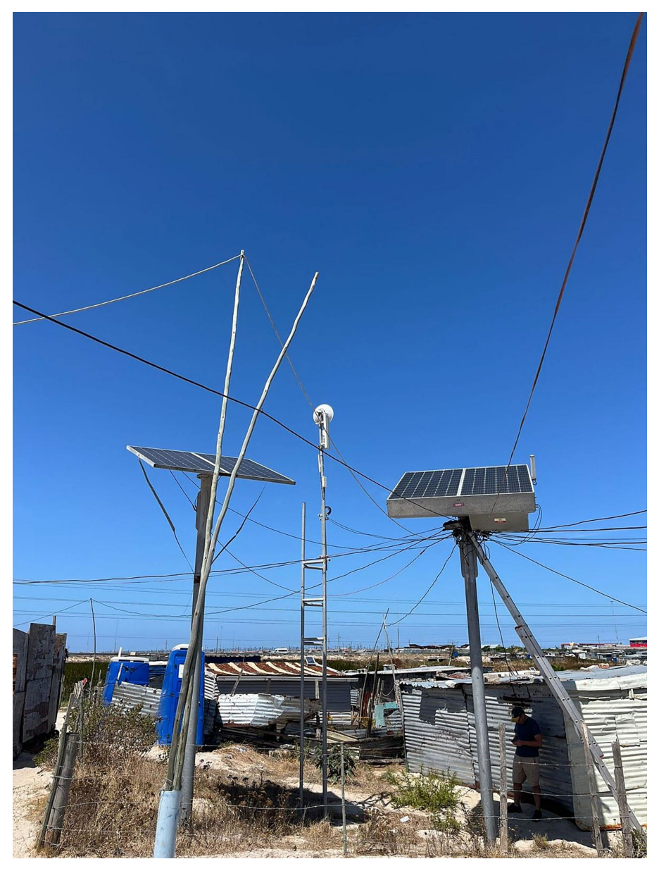
FIGURE 3 Solar towers installed in Qandu Qandu, Cape Town.

Crucially, then, there is a key productive tension between understanding wellbeing and its link to energy through generalised, normative conceptualisations of how wellbeing should be defined, measured and operationalised; and more granular, dynamic and relational understandings of wellbeing as subjective as well as partly knowable in generalisable ways. This tension is replicated at the global policymaking scale, as well as at scales concerned with municipal and regional governance, although policymakers have made efforts to engage with subjective wellbeing. In 2011, for example, the OECD's publication How's Life? Measuring Well-Being devoted its twelfth and last chapter to the question of measuring subjective wellbeing, which it defined as life satisfaction, and positive and negative affect (OECD, 2011). Whilst this recognises the emotional aspects of the experience of wellbeing, there is a need to engage with the notion of wellbeing as not only a passive state experienced by individuals, but also a dynamic