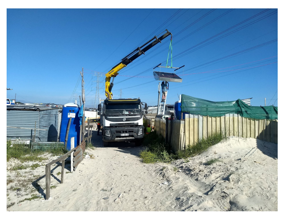
FIGURE 2 Installation of the microgrids.

to focus more closely on granular and relational understandings of wellbeing and socio-electric landscapes (Munro and Schiffer, 2019). The research team were involved in the design and study of the microgrid-based project detailed above. This informed their understanding of the energy-wellbeing-informality nexus as discussed in the paper. The microgrid intervention was extensively documented through project and partner meetings, site visits and community discussion sessions in Qandu Qandu. A baseline survey was carried out with 52 Qandu Qandu residents through DataHuddle, a data-free app developed by the Thrie Energy Collective and that can be used on the sort of entry-level mobile phones commonly used in Qandu Qandu. The survey was focused on forming a basic understanding of energy use and access to different forms of energy by Qandu Qandu residents.