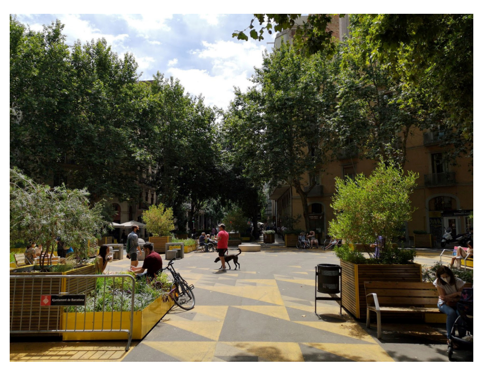
FIGURE 2 Example of tactical urbanism in Barcelona Superblocks. Summer 2021

(IGJ for temporal generations) while reducing long-term effects on the urban environment (IGJ for intertemporal generations).