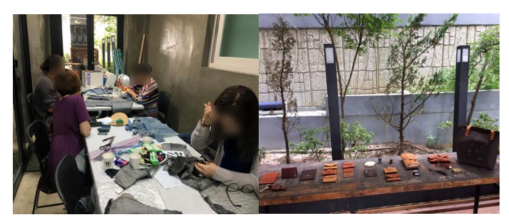
FIGURE 4 Jeongneung-dong artists activities (leather workshop and exhibitions).

forced to withdraw from the area, which was a timely response but not a fundamental solution (Phillpot, 1992). At present, although the housing market in Korea supplies a large number of houses every year, the unaffordably high housing prices have led to a corresponding increase in the proportion of vacancies, and the housing problem of low-income groups such as artists has become increasingly serious. By unified management, the government can guarantee the basic housing rights of the art community while avoiding speculation caused by the re-entry of vacant houses into the secondary market, thus guaranteeing the sustainable development of the public housing market.