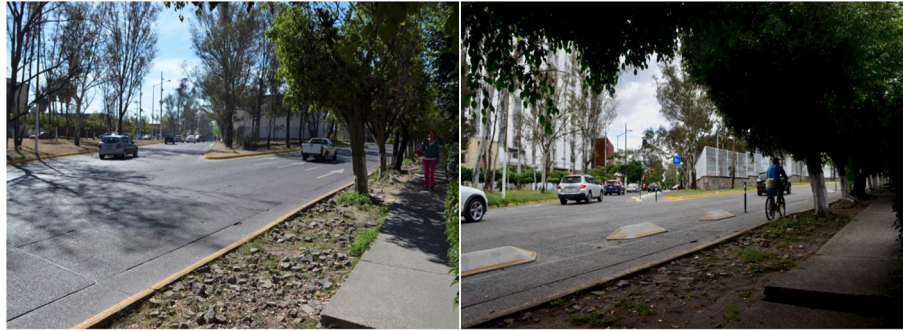
FIGURE 1 | Before (left) and after (right) installation of the bike lane on Av. Guadalupe.

20% of households do not own a car or truck and approximately 27% use a bicycle as a mode of transport (INEGI, 2010).