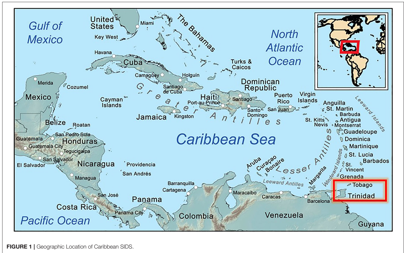
FIGURE 1 | Geographic Location of Caribbean SIDS.