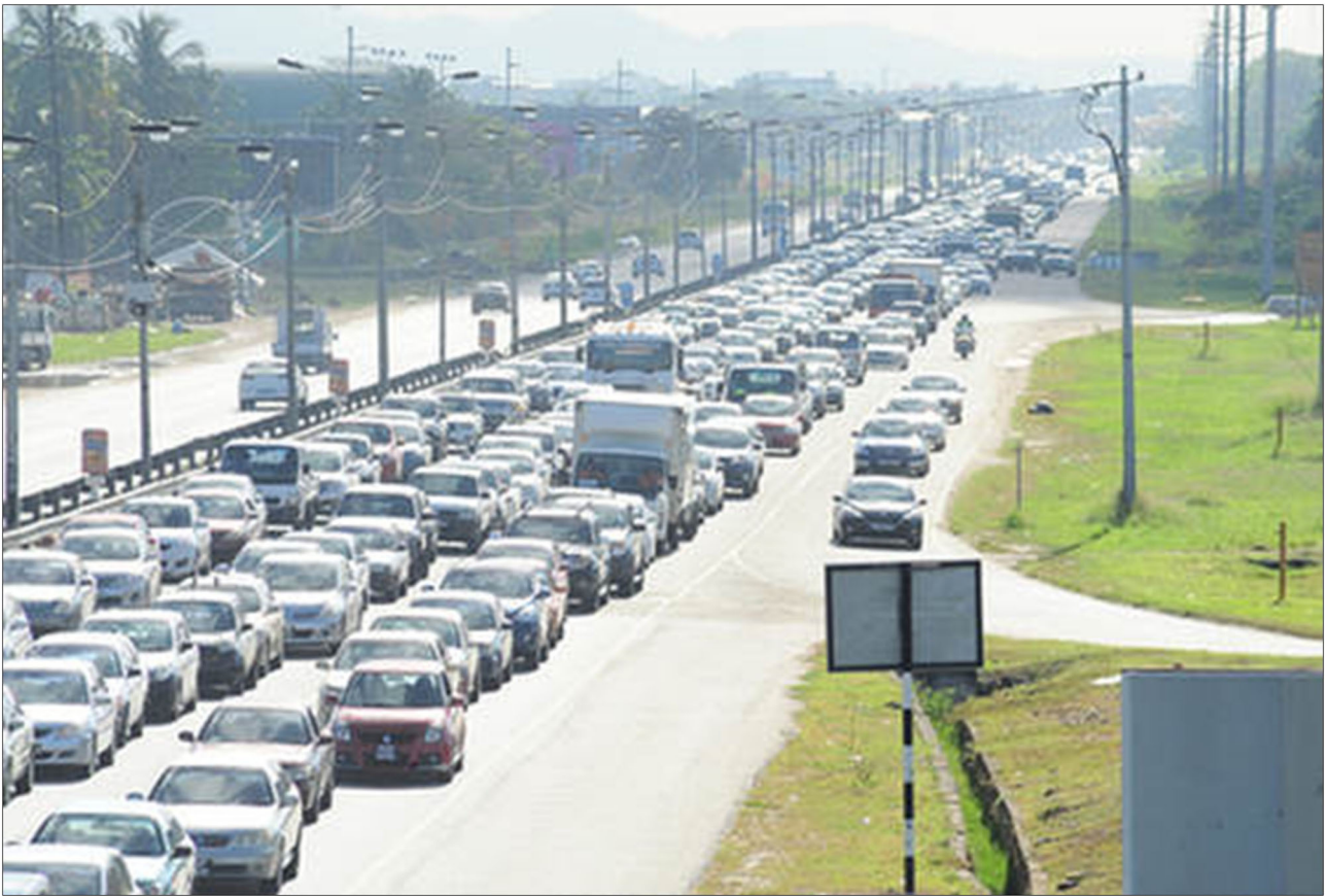
FIGURE 3 | Urban Gridlock Traffic Entering Port of Spain.

vulnerability, environmental fragility, very high vulnerability to climate change and natural hazards, rapid urbanization trends, and urban poverty, if it is to be impactful in meeting SDG 11 targets. In particular, these countries are characterized by a unique urbanization pattern manifested in the existence of primate cities, low-elevation coastal zone cities, and informal urbanism. Rapid urbanization presents difficulties for Caribbean SIDS that must clear the backlog of housing, infrastructure and social services resulting from a high and accelerated demand relative to supply. Yet, a NUA for achieving SDG 11 cannot be tackled on a sectoral basis due to the cross-cutting themes which comprise this goal. Even the indicators and targets that are being used to measure progress in achieving the SDG 11 must be conceived as interdependent and should be pursued together, otherwise progress in one area may contradict progress in another. Key actions are communicated in this section to articulate priorities that are needed to fulfill SDG 11 in the context of a Caribbean SIDS specific NUA. The critical issues are prioritized and discussed in sequence as next steps for decision-makers to take in an effort to help these countries stay on track in meeting SDG 11 by 2030. It is important to note that these actions do not have a structural hierarchy, but rather are interdependent and mutually reinforcing. Further, these actions